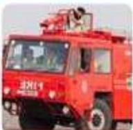
Fire Engine Rides