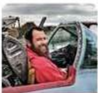
Climb in the Cockpits